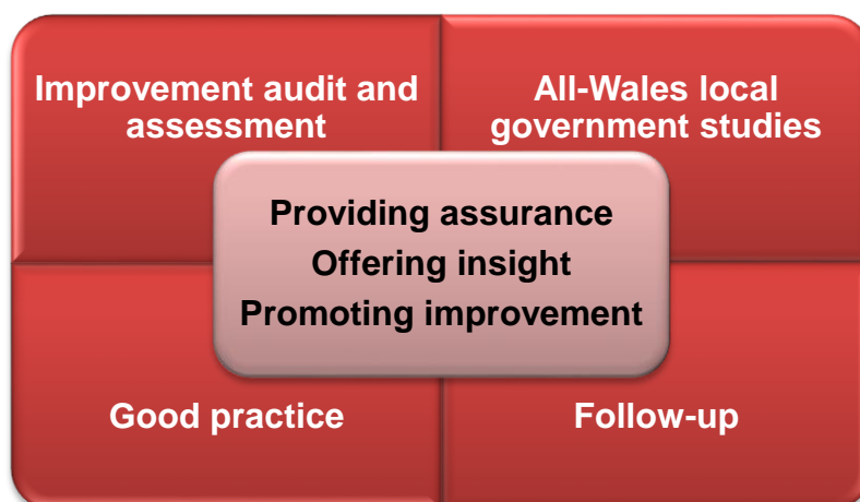
Exhibit 3: Components of my performance audit work